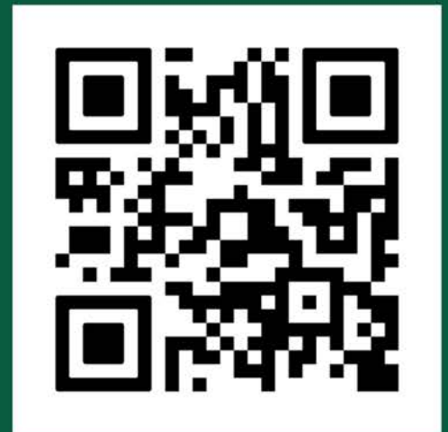
◀ Old Kilquiggin Graveyard

Stay in the nearby, Madelines Accommodation, only 10km from the resting place of Presley's ancestors at Kilquiggin graveyard. ▶